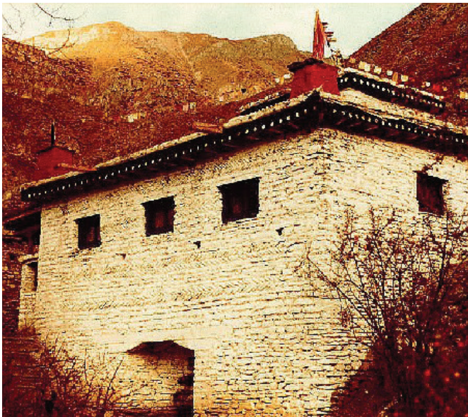
The "Temple Of Miraculous Fire" at Muktinath, Nepal. Photo by Ken Street (Nov. 1979).

[For more on this subject, please read our tract The Temple Of Miraculous Fire .]